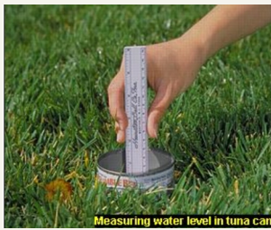
Measuring water level in tuna can