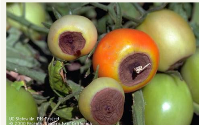
UC Statewide IPM Project © 2000 Regents of the University of California